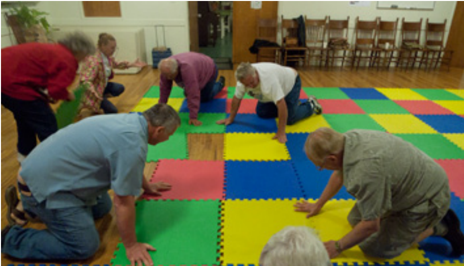
Fixing the squares at the Native Sons Hall

Newsletter of the Monterey Bay Iris Society