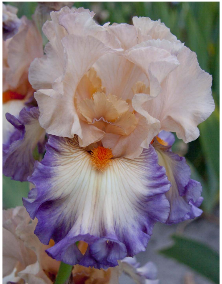
Polite Applause, Ghio, 2011