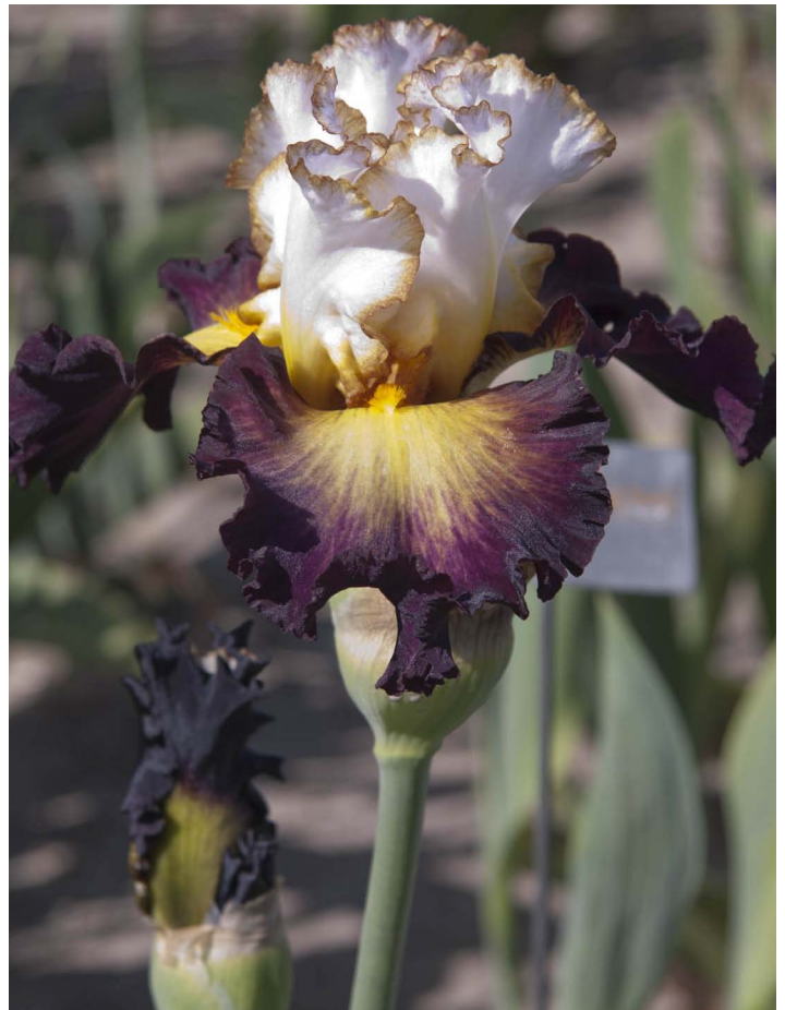
Superhero, Ghio, 2012