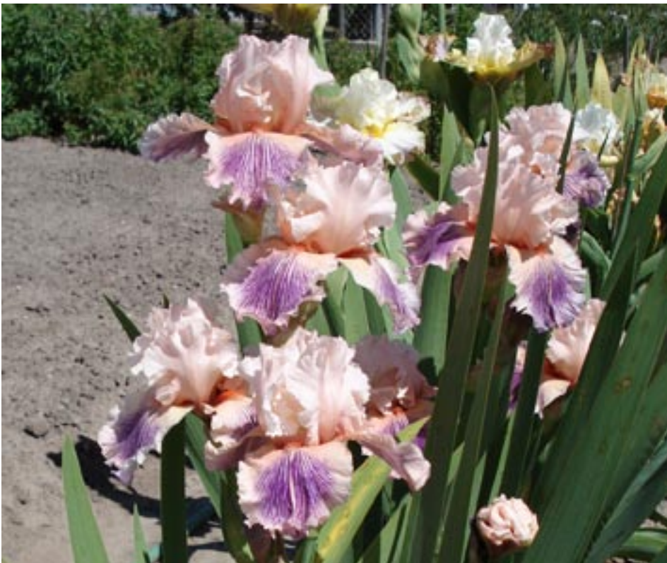
Splurge, 2010 Ghio introductio