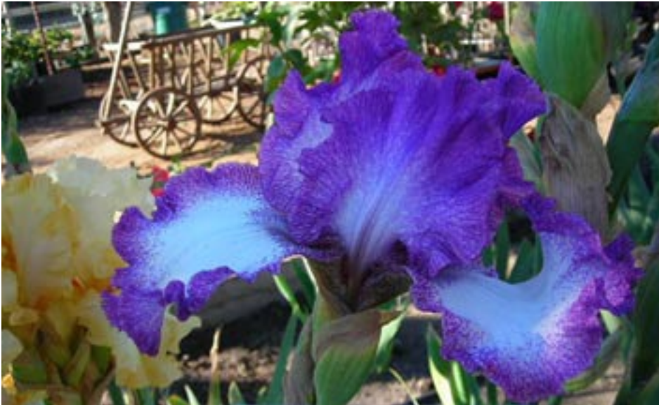
Iris in November