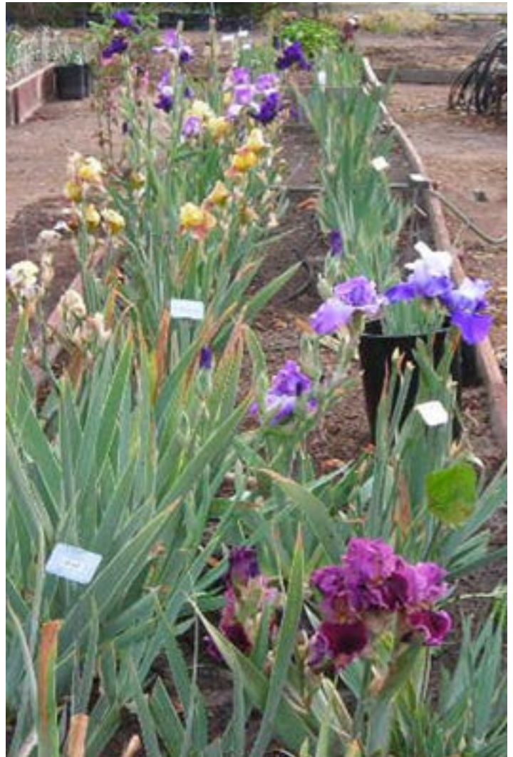
More Iris in November