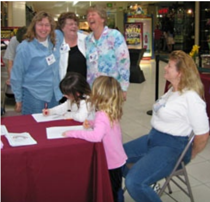
The "host ladies" whoop it up!