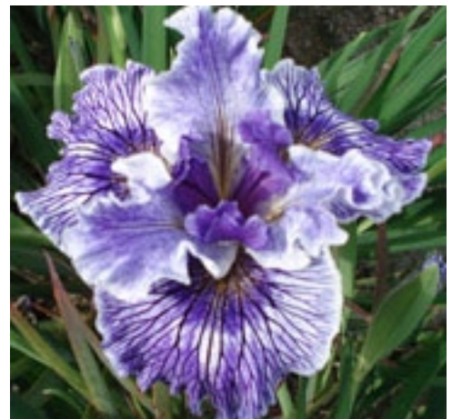
Joe's PCI Bay Street

All members are encouraged to volunteer as much time as possible during our show. Participation goes a long way in making our show a success and introducing the public to our club. And—It is great fun “Sharing the Joy of Iris” with people oooing and ahhing over our gorgeous blooms.