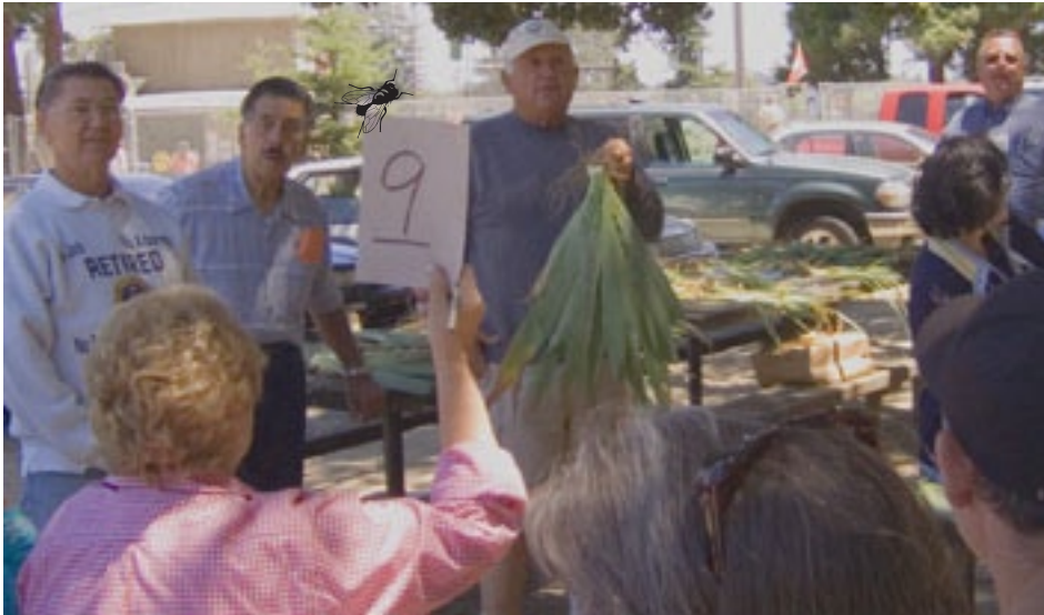
Bidding on iris at the July picnic.