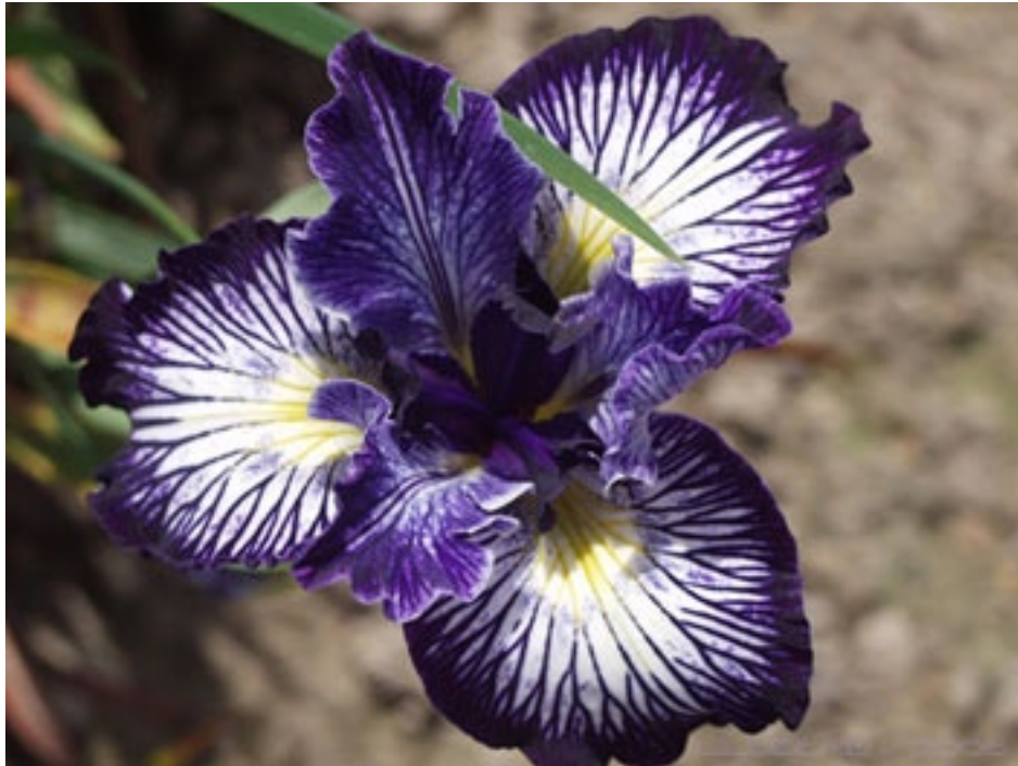
Star of the Evening