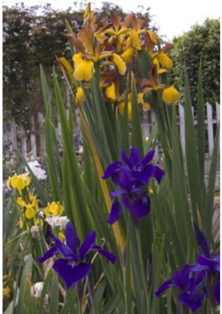
Spuria Wyoming Cowboy with other beardless iris