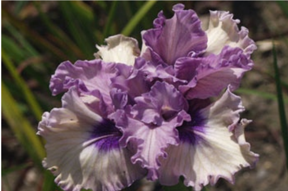
Bowl of Fluff

Newsletter of the Monterey Bay Iris Society